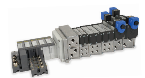
Turck on H Series ISO